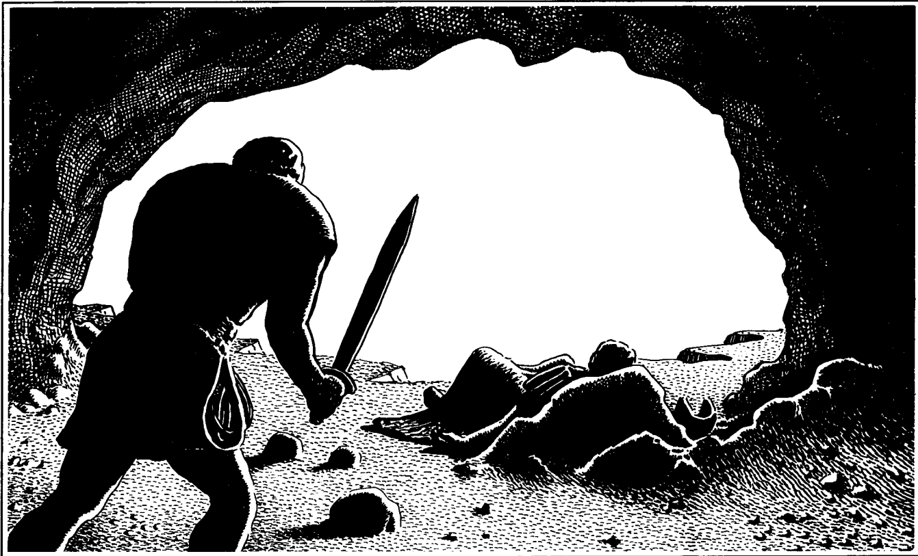
David quietly crept from the back of the cave to cut a piece of cloth from Saul's robe.

We can see from Saul's example how dangerous anger and jealousy can be. It is important that we all learn to control our tempers and emotions. Many people have been hurt or killed because of jealousy and hatred. We should try to follow David's example, and not the example of King Saul.