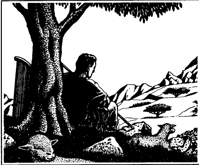
David returned from the king's palace to continue caring for his father's sheep.