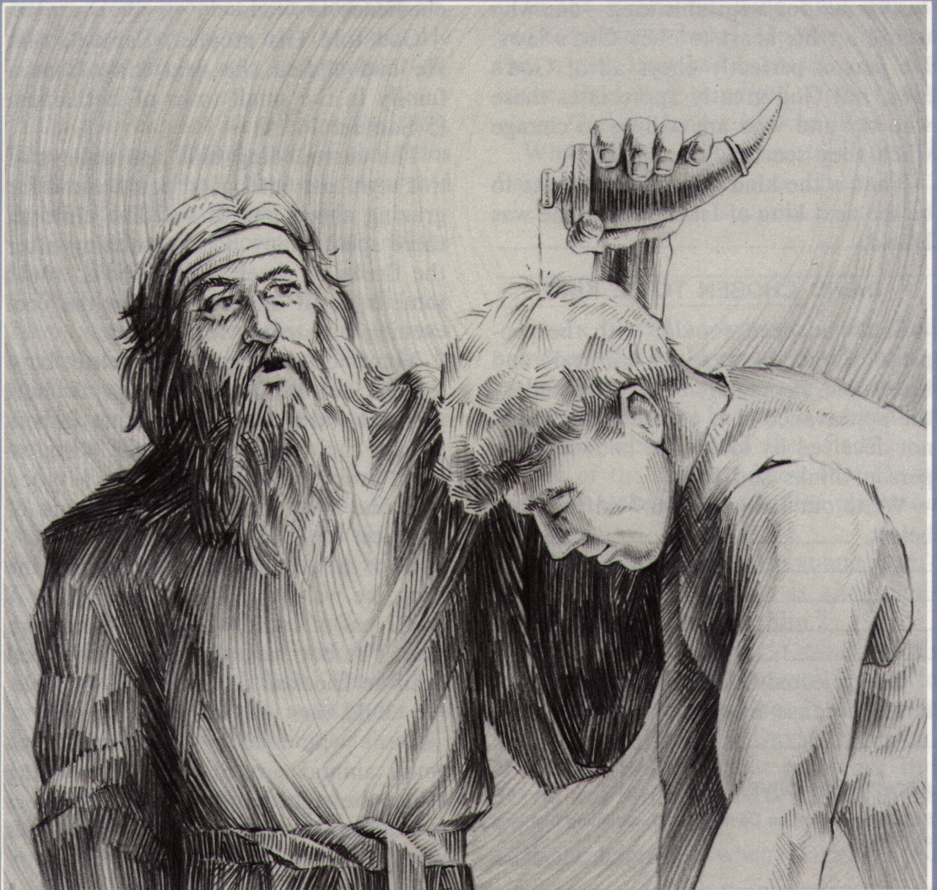
David Is Anointed King of Israel